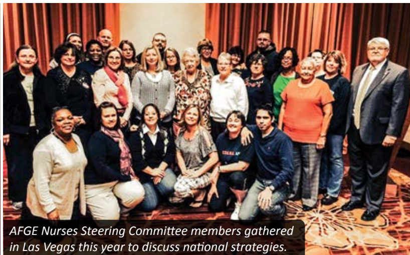
AFGE Nurses Steering Committee members gathered in Las Vegas this year to discuss national strategies.