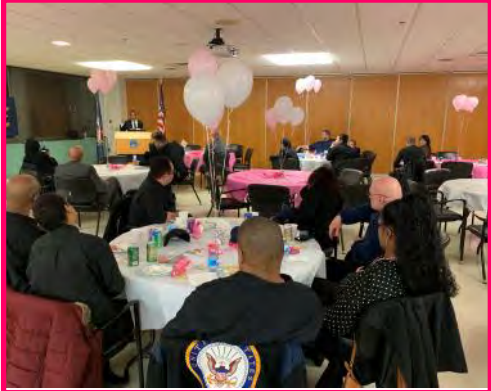
Congressman Espailat addresses the attendees.

Keep in touch with Y.O.U.N.G. Contact 2nd District Y.O.U.N.G. Vbarrowyoung2@gmail jenniferramirezafge@aol.com Facebook: AFGE District 2 Y O U N G