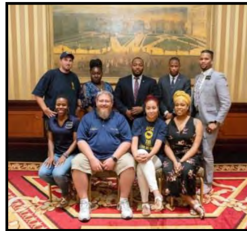
YOUNG members at 2018 Convention.