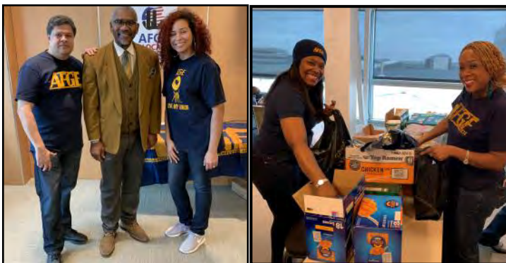
L3369 showed solidarity With TSA Workers at JFK During Shutdown by providing a lunch & learn and bags of non-perishable foods. Congressman Meeks is shown on left with AFGE reps.