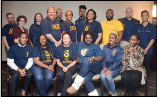
AFGE Y.O.U.N.G. Committee members met with AFGE instructors in Washington, D.C. prior to LegCon to take part in leadership training.