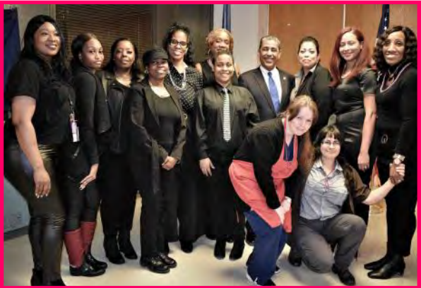
Congressman Espailat (back, 4th from right, blue tie) & AFGE.