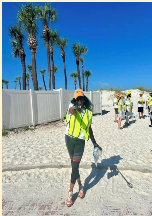
L548 Clearwater Beach Clean Up