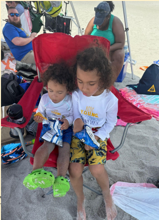
L556 Little Helpers Clean Up Cocoa Beach