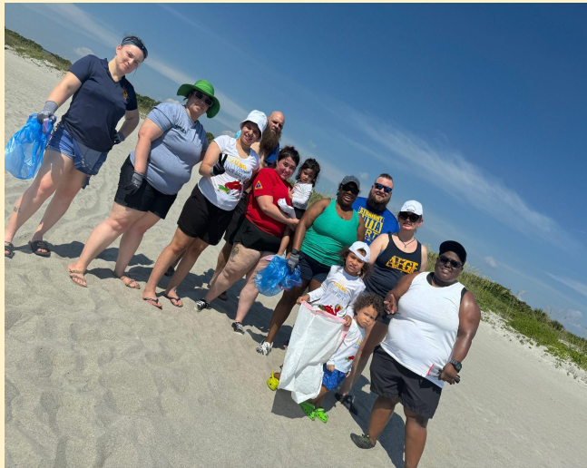
L556 Family and Friends CLean Up Cocoa Beach