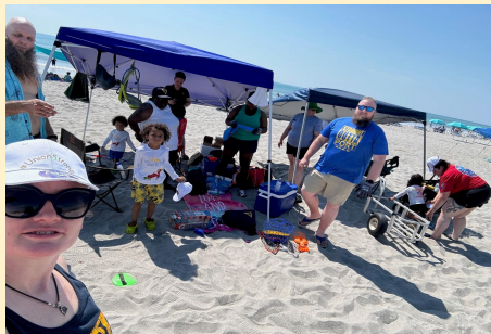
L556 Family and Friends CLean Up Cocoa Beach 2