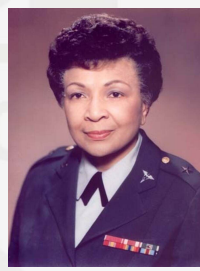
Brig. Gen Hazel Johnson-Brown

The first black female General in the United States.