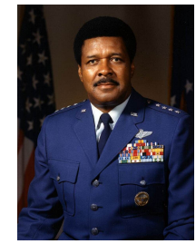
Gen Daniel "Chappie" James Jr.

A former Tuskegee Airman, was the first African American promoted to the rank of four-star general in 1975.