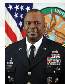
Gen. Lloyd Austin

First African American Secretary of Defense.