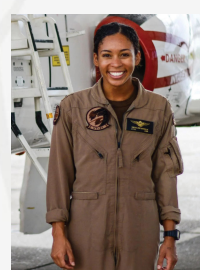
Lt. j.g. Madeline Swegle

The Navy's first Black female tactical fighter pilot.