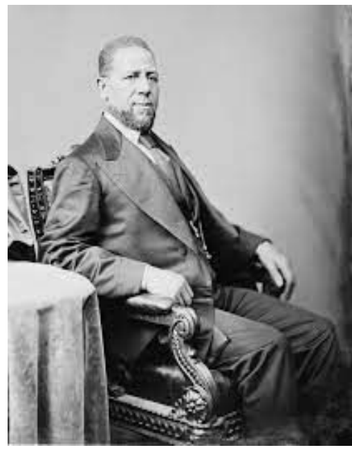
Hiram Rhodes Revels Civil War Army Veteran & Union Champlain

On February 25, 1870, Revels was sworn in the U.S. Senate - representing the former Confederate state of Mississippi. Senator Revels was the first Black American to serve in either chamber of the U.S. Congress. After his first term in the Senate, Revels served as Mississippi's Secretary of State and the first president of Alcorn State University. His election by the Mississippi legislature marked one of the greatest triumphs of Reconstruction - the Union project to build the democracy that the leaders of the abolitionist movement and the late President Lincoln had envisioned.