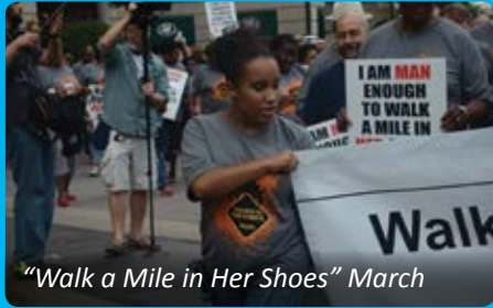
"Walk a Mile in Her Shoes" March