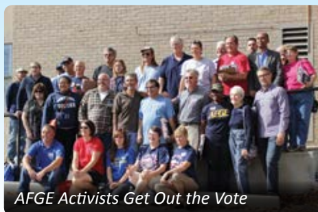
AFGE Activists Get Out the Vote