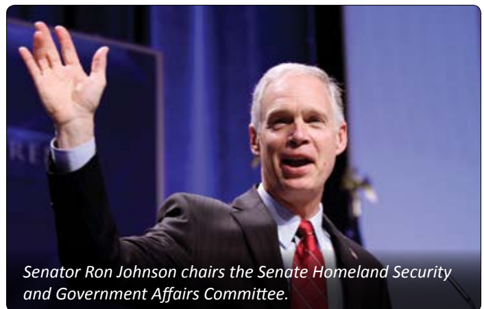
Senator Ron Johnson chairs the Senate Homeland Security and Government Affairs Committee.

To win a better future for our families and our country, we need to build the strength of our union. We can do this by growing our local unions, engaging our union brothers and sisters to get involved, and holding elected leaders in Washington accountable.