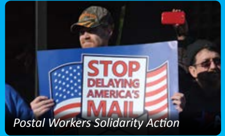
Postal Workers Solidarity Action