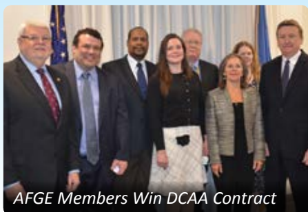
AFGE Members Win DCAA Contract