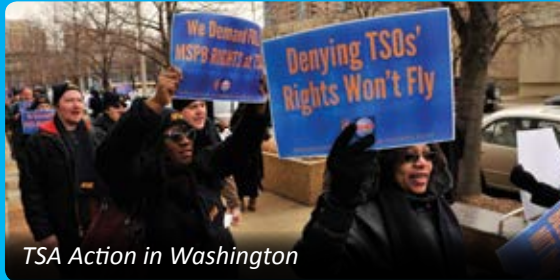
TSA Action in Washington