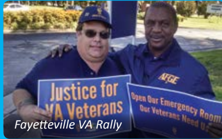
Fayetteville VA Rally