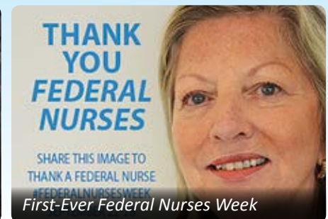
First-Ever Federal Nurses Week