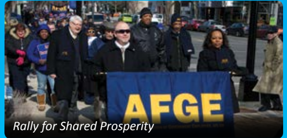
Rally for Shared Prosperity